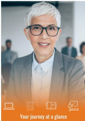
Your journey at a glance